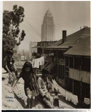
Children play in a Barrio with downtown Los Angeles in the background, 1946