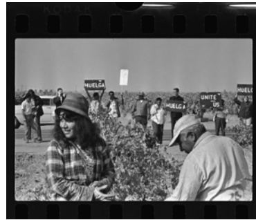
United Farm Workers strike near Oxnard, California, 1966