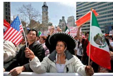
Immigrant Rights rally in Philadelphia, 2006