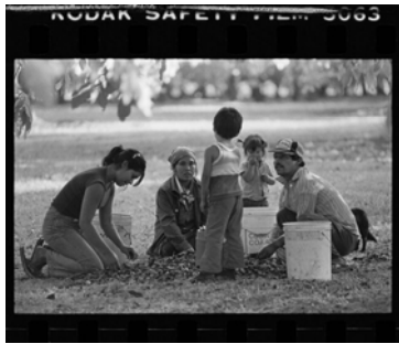
A family of Walnut pickers from Northern California, 1983